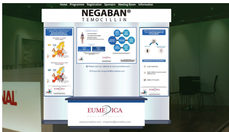
Example stand presented at the British Infection Association – 15 th October 2020